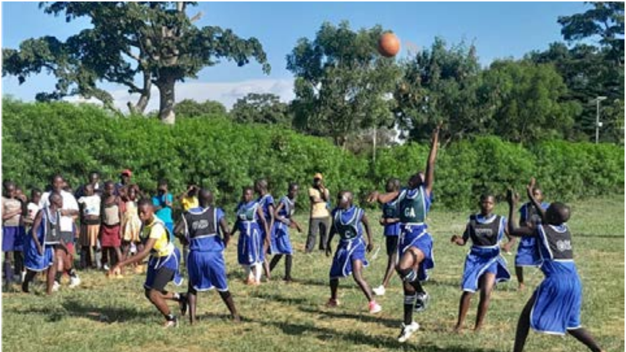
Kyankwanzi team in Gulu

Building on this momentum, the Under-14 girls' team carried the district's flag high again in 2024 during the largest edition of the UPSSA Ball Games, held in Soroti. Out of over 6,100 athletes from 154 local governments, Kyankwanzi made headlines with a remarkable 19–3 triumph over Sheema