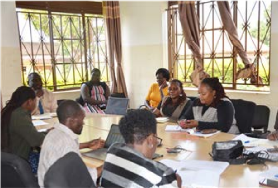
Participants actively engage during the Luwero District stakeholder meeting on maternal and perinatal health interventions