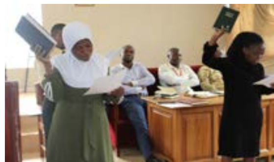
Newly appointed and promoted civil servants take the oath of secrecy at the conclusion of a two-day induction training held at Kiboga District Council Hall