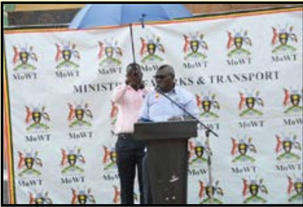
Gen. Edward Katumba Wamala, Minister of Works and Transport giving his key note speech