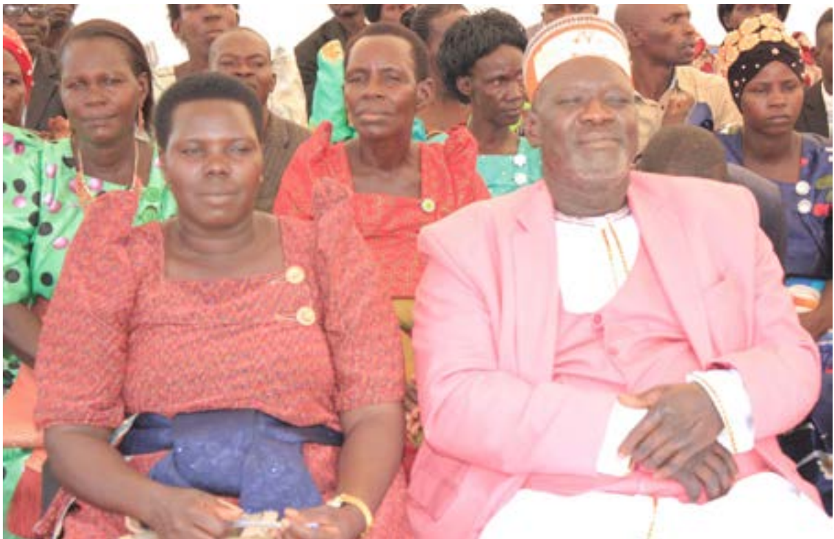
Community members and cultural leaders of Buruuli attend the official handover ceremony of government vehicles at Kalemere-Kanyamusuba Palace

The Buruuli cultural leadership reaffirmed its commitment to unity, cultural preservation, and collaborative development as it continues to engage government institutions and local communities.