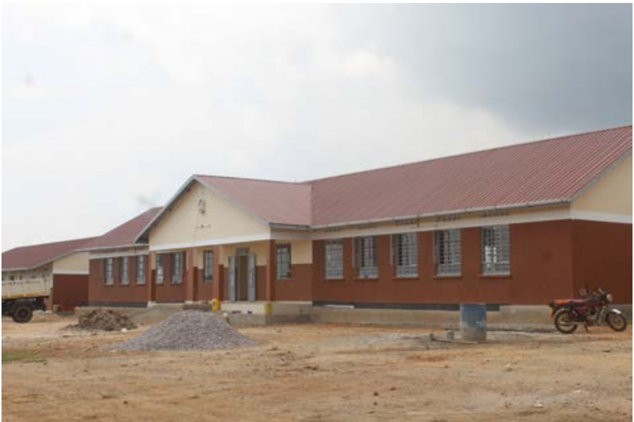
Main Block Housing the Computer Lab and Library