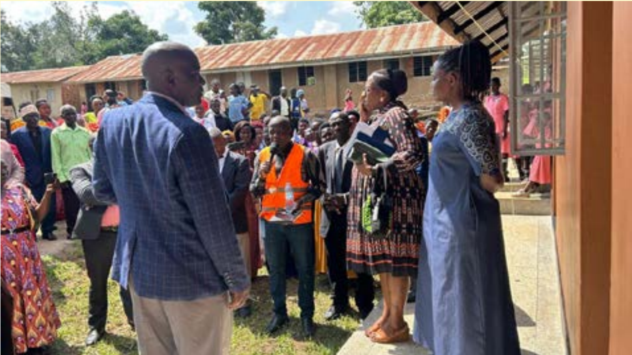
District officials join members of the community during the commissioning ceremony of the newly constructed classroom blocks

acceptable standards. This is evidence of proper supervision and commitment," she noted.