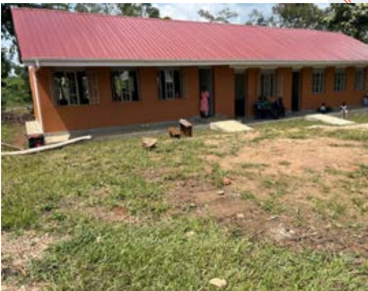
The newly constructed two-classroom block with an office at Ndeeba Primary School, commissioned under the FY2024/2025 government education infrastructure program

"During District Executive Committee monitoring visits, we consistently found the construction work to meet