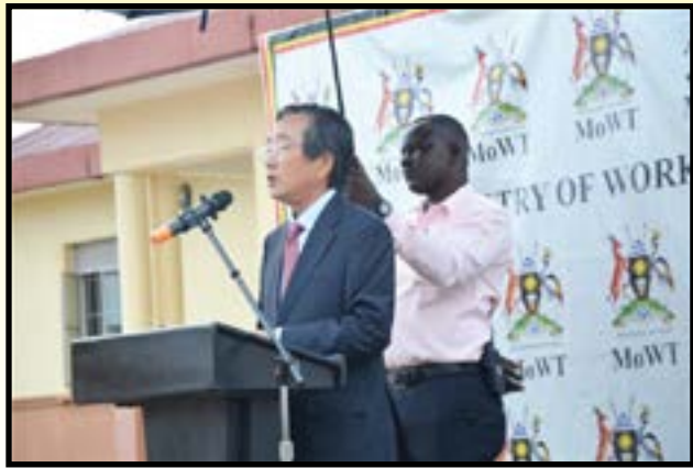
Japanese Ambassador, H.E. Takyuka Sasayama gives his speech at the event

The visit marked a milestone in Uganda–Japan bilateral cooperation, with the center standing as a flagship project supported by the Government of Japan. The facility is designed to provide refresher courses and certification for machine operators, aligned to East African regional standards. Already, the center is attracting participants from various districts and is poised to become a regional hub for training in heavy machinery operation.